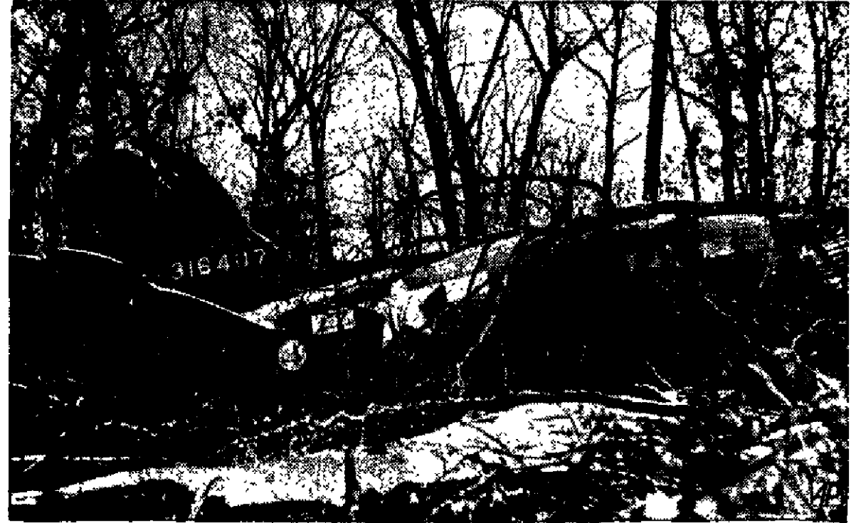
WRECKAGE OF ARMY TRANSPORT-Fuselage and tail of an army transport plane rest amid acrub and snow near Blue Mounds, Dane county, Wis. The plane was believed en route to Minneapolis, Minn., from Chicago, Ill. Three of the members of the crew were found dead.